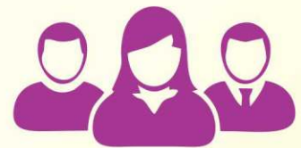
Background Check on Every Staff