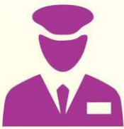
Trained Security Guards